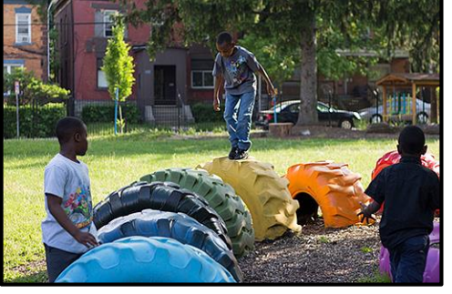
Vacant lot transformations