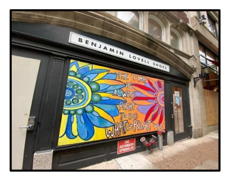
Painting boards on vacant properties