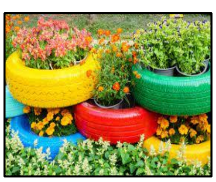
Creative landscaping and reuse