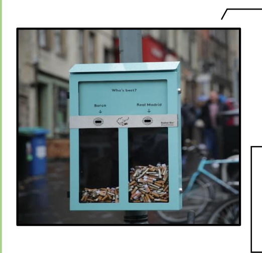
Competition Cigarette Disposal Sites Keep buds off your streets by turning it into a friendly competition. The box with the most buds winds!