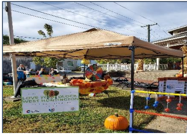
1. Community Activities

Projects must fit into at least 1 of the 3 following Project Categories (see our LYB Project Example sheet for more information):