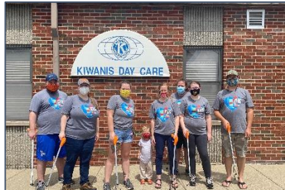
2. Litter Prevention