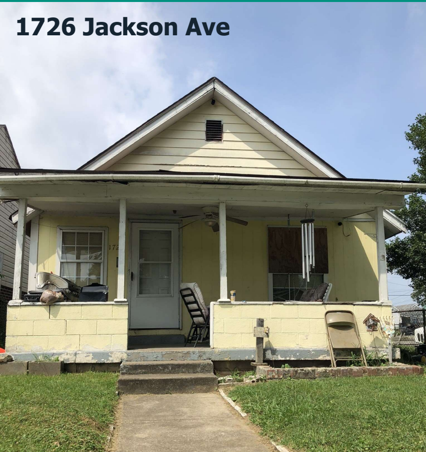
1726 Jackson Ave