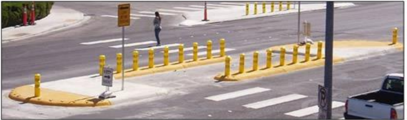
Danish Crossing in Las Vegas, Nevada

A Danish Crossing, also called a Danish Offset or Z-Crossing (because of its unique, z-shaped design), is a type of crosswalk used on multi-lane roads. This crosswalk has two segments off-set from each other with a protected median. This design makes pedestrians face oncoming traffic so they can see when it is safe to cross the street. The protected median in the center shortens the distance that pedestrians must cross and provides a safe area for pedestrians waiting for an opening to cross.