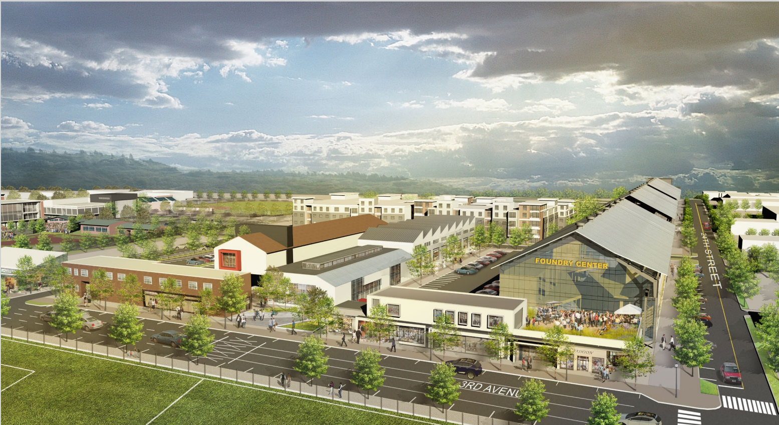
Foundry Center - New development and adaptively reusing some of the ACF structure allows for the creation of a unique mixed-use setting that includes: offices, research, housing, retail, maker-space, and destination recreational and event venues.

Benefits & Impacts: The H-BIZ project will revitalize a long-blighted and under-utilized neighborhood that is located in a prime location in Huntington. The H-BIZ plan calls for 1,000,000+ square feet redevelopment and up to $200,000,000 in public and private sector investment that could produce as many as 3,000 jobs including 1,250 permanent jobs and 1,750 construction jobs. Huntington can reclaim an abandoned riverfront, expand Marshall University’s powerful athletic program, and restore a struggling neighborhood.