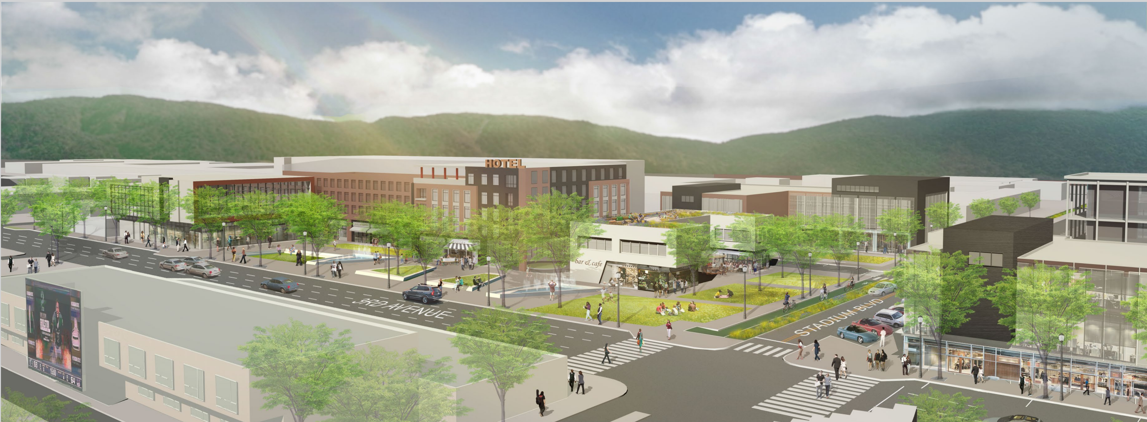
University Place and Foundry Center – The redevelopment of the McGinnis and ACF sites is the key to connecting the Highlawn neighborhood with the rest of the City as well as providing access to the river and accomodating additional recreational opportunities. This area in the core community along 3rd Avenue can provide a vibrant mix of new uses ranging from retail, sports and entertainment, institutional, and office development to industrial and manufacturing facilities, creating a catalyst for much broader community revitalization.

• Area Improvements: Huntington is prepared to make area improvements to foster revitalization. The plan calls for re-establishing a street grid between 20th Street & 27th Street from 3rd Avenue to the riverfront in order to create one comprehensive, mixed-use development that meshes seamlessly with the Highlawn neighborhood and Marshall University. Huntington can foster a traditional, walk-able commercial zone by clustering retail/office uses along 3rd Avenue, by deploying streetscaping, traffic calming, public spaces, and green/stormwater infrastructure to create a desirable and environmentally responsive neighborhood.