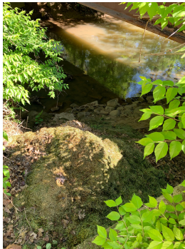
Dumping grass clippings into Fourpole Creek.