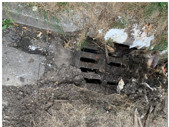
Disposing trash into the street.