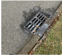
Dumping paint or cement work into drain.