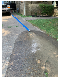
Discharging muddy water into the street.