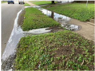
Washing dirty car on the pavement.

The Stormwater Utility detects and eliminates illicit discharges whenever possible. This is done with the help of citizens.