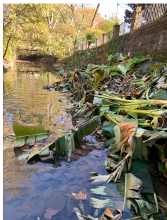
Dumping yard debris into Fourpole Creek