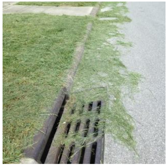
Grass clippings left in the street by storm drain.

Keep yard debris and grass out of streets. It can block storm drains and cause localized flooding. Public works department will collect up to four bags of grass clippings with each trash pick up.