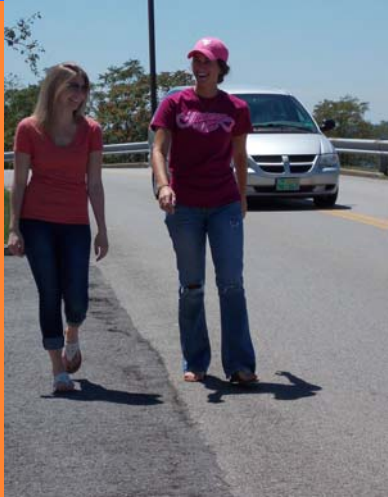
These pedestrians are unaware of an approaching vehicle.